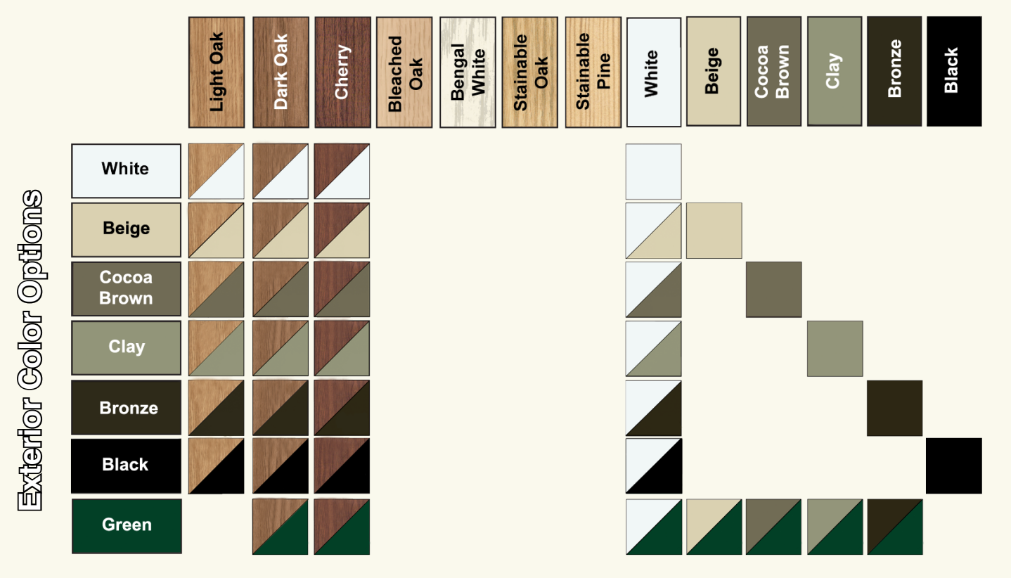
One Of The Only Manufactures To Offer Green! Woodgrains and colors are digital reproductions and may not be 100% accurate.

Interfor Woodgrain And Solid Color Options